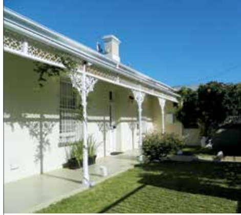
K-HOUSE FRONT YARD